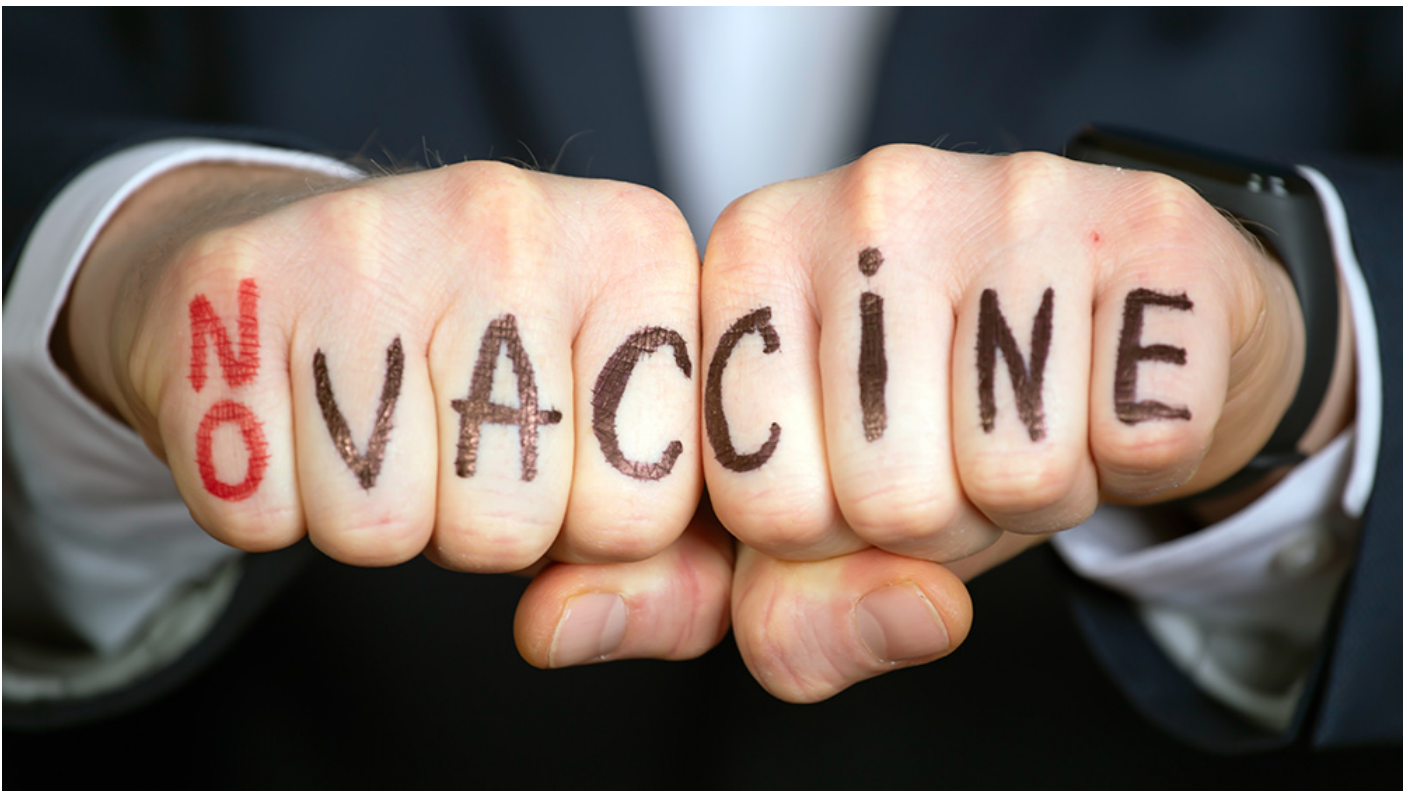
Panic? US mega-corporations rush to abandon vax mandate